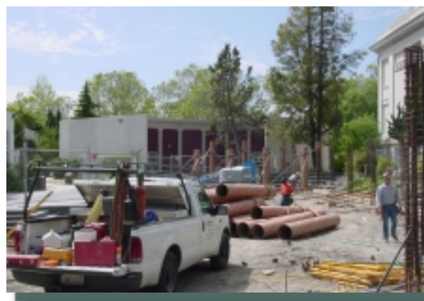
Work resumes in the Quad