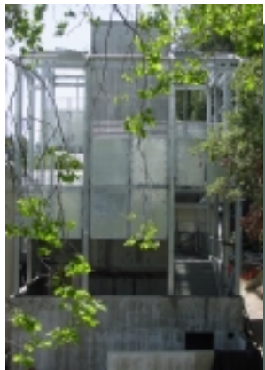
The new Jungle Gym?

The sound of music can once again be heard coming from the music building. The entire building has received new flooring and paint. Some practice rooms were enlarged to accommodate larger ensembles. New ceiling tiles were installed to enhance the acoustics of the music rooms. Electrical, telecommunication, fire alarm and security systems have been upgraded. New windows have been installed throughout the entire building.