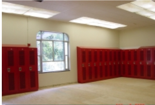
Varsity Girls Team Room