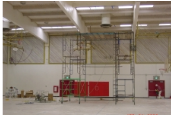
Painting of Gym ceiling