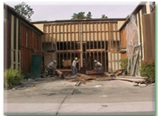
Structural upgrades to Humanities Building

Work is also progressing in the library media center. The main entrance and circulation counter is being relocated to the southeast side of the building facing the new quad, which is another indication that the focus of the campus is shifting toward the quad. The former administrative offices have also been redesigned and will house a much-needed conference room, a consolidated book room, and the student store, "Pirate's Port."