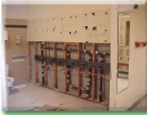
Demolition of the changing rooms in the Pool Building

Overall, student programs will benefit as the modernization project brings upgrades to classroom interiors, corridors and department offices. The work will enhance the learning environment by creating a more dynamic campus and improved interior space. Fire alarm, security, telecommunication, clock-bell and data systems will be improved, providing a higher degree of safety and security campus wide. Also, access for the disabled will be upgraded throughout the campus.