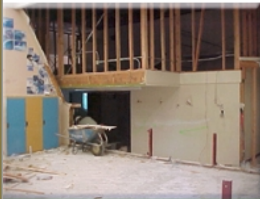
Left: Interior demolition of Humanities Building