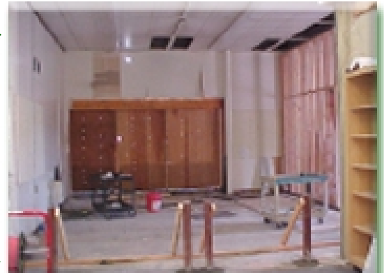
Right: Construction of new circulation counter in the Library Media Center