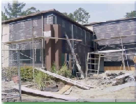
Exterior finishes to Humanities Building

With the completion of three new buildings by Ralph Larsen & Son Inc., the baton has been passed to Barry Swenson Builder to bring the existing buildings on campus into the "modern age."