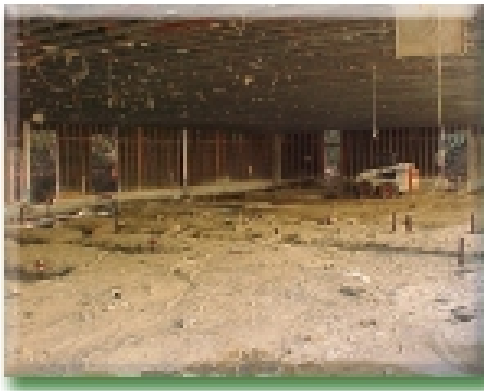
Demolition of the Locker Room Building