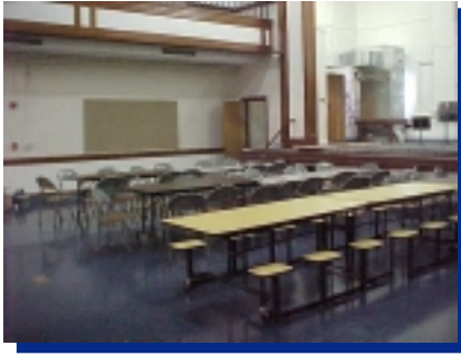
New sapphire blue floor

The original 1915 vintage steam boiler has been replaced by a new hot water boiler, new piping and new unit ventilators throughout the building. A new phone-intercom system will be installed and the fire alarm and security systems also will be upgraded.