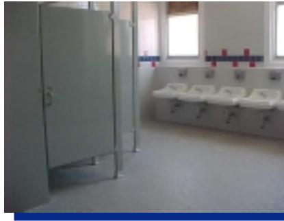
Remodeled bathrooms show school colors

portable classrooms. The entire project will be completed by April of 2003.