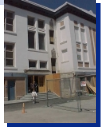
Preparing for new elevator tower