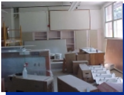
Classroom in process of being remodeled