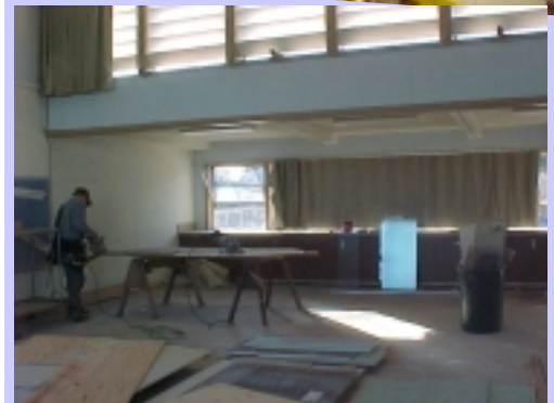
Phase III underway