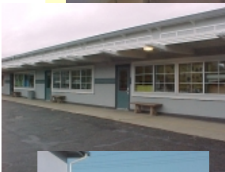
Left: new windows