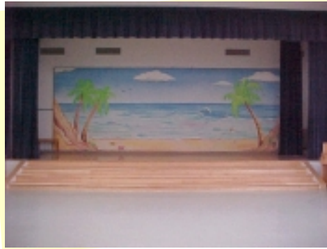
Enlarged stage in multipurpose room

Come March, when the project concludes, the ten portable classrooms at the northwest end of campus will be removed. The portion of the playing field where the portables were installed will be replanted with grass. Fencing will be installed at the campus' westernmost boundary on Palm Street, providing additional security for students.