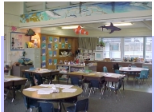
Completed Phase II classroom