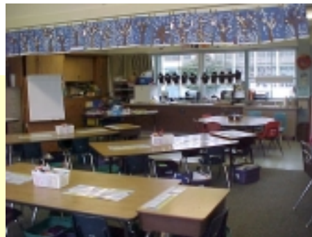
Above and below: completed Phase II classrooms