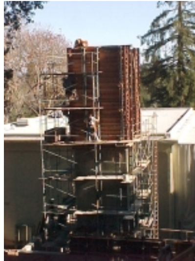
Construction of elevator tower