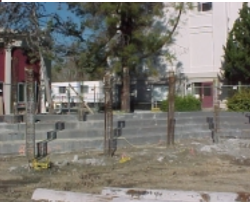
Drilling of columns in the quad