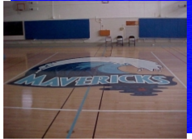
Beautiful gym floor with custom-painted Mavericks logo

The interior of the gym building is also nearing completion. The big gym floor sports a bold blue, custom-painted, Mighty Mavericks logo. The new, automated bleachers for the big gym are scheduled to arrive the first part of February 2003 and will be completely installed by March 1, 2003. Both the boys and the girls' locker rooms are nearly complete, including all new lockers. The renovated shower and bathrooms have new plumbing fixtures, partitions, and tile on the walls and floors.