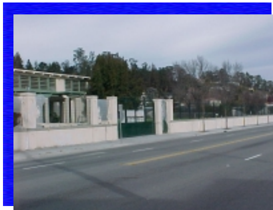
Sound wall on Mission Street

A collaborative effort among Caltrans, the City of Santa Cruz and the Santa Cruz City Schools District was the force behind the building of the sound wall along the school's property line at Mission Street. Decorative tiles designed by art students at Mission Hill will accent the wall.