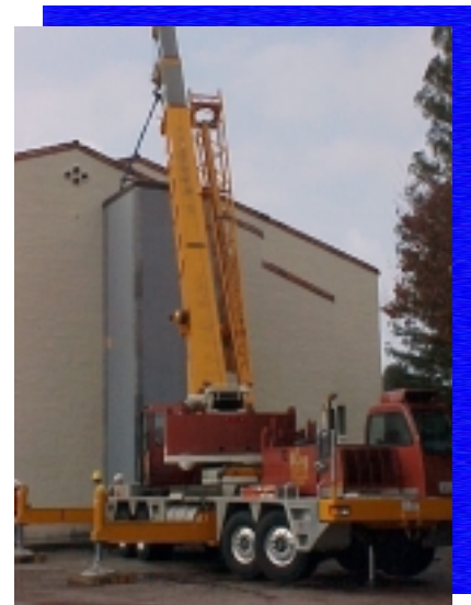
Installation of elevator

The new two-story, pre-fabricated elevator arrived on December 15, 2002, the afternoon of this winter's biggest rain and wind storm. Fortunately, the morning of December 16 was dry and calm, allowing for a smooth installation. Currently, the hydraulic and electrical systems are being connected, and the elevator is expected to be operational by March 1, 2003.